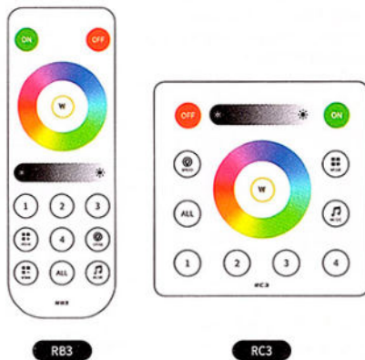
(Requires separate purchase)

NOTE: For more information, refer to "2.4G Touch Remote Control Instructions"